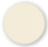
Classic Sand 11