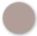
Adobe Clay* 60

Porch Ceiling is available in 8' and 12' 6" panel lengths.