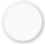
White Birch 02