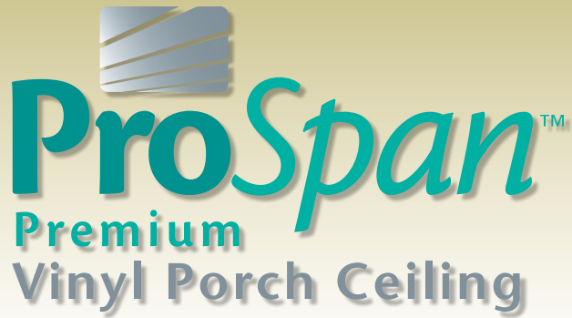
Solid Porch Ceiling