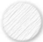
White Birch 02