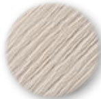
Autumn Taupe 28