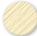
Sunny Maize 22