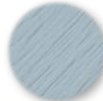
Victorian Slate* 67