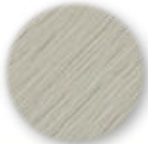
Vintage Sage* 55