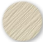
Warm Sandalwood 17