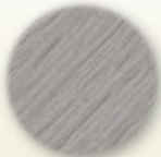
Charcoal Grey* 84

*Premium colors made with Armor Coat UVA™ and Solarkote®PB.