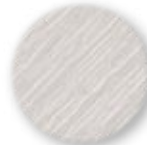
Harbor Stone 44