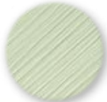
Concord Green** 48