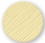
Providence Yellow** 24