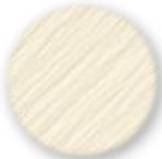
Classic Sand 11