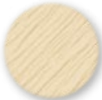
Summer Wheat 26