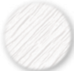
White Birch 02

Double 4, Double 5, Dutch Lap 4.5 and Dutch Lap 5