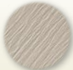
Terra Clay* 55