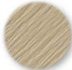
Adobe Clay* 60