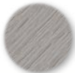
Charcoal Grey* 84

*Premium colors made with Armor Coat UVA™ and Solarkote®PB.