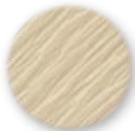
Wicker Beige* 65