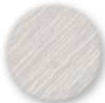
Harbor Stone 44