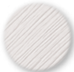
New Linen 13