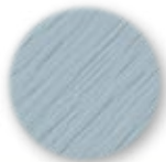
Victorian Slate* 67